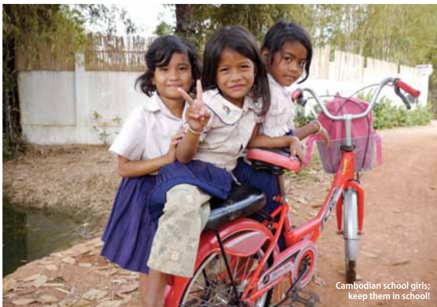
Cambodian school girls; keep them in school!